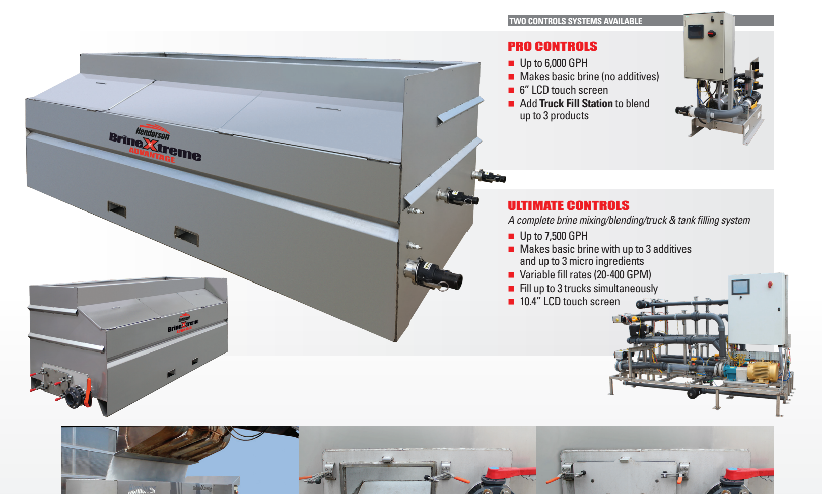
Produce Professional Grade Salt Brine and Clean Out Easily with Large, Unobstructed Openings!

When you need basic professional grade salt brine fast, look no further than BrineXtreme Advantage by Henderson!