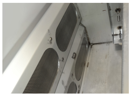
Brine transfer screens and high & low floats shown