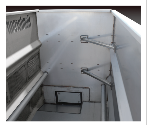
Large solids clean-out and inside ladder shown