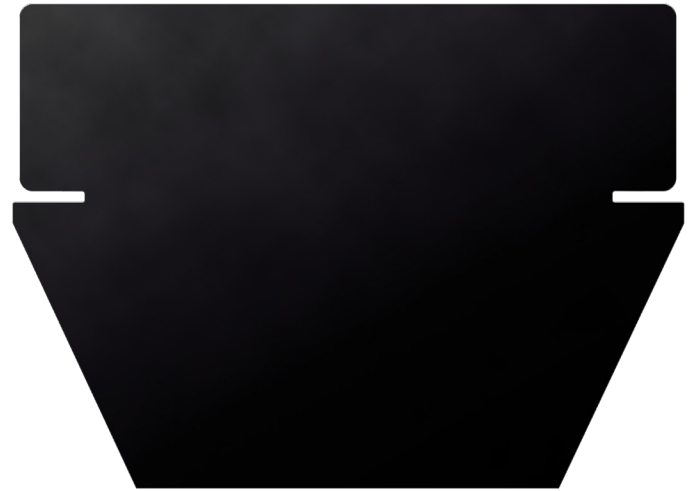
HTE208 24.50" x 33.13" overall 3/4" thick steel MUST ORDER IN GROUPS OF 7: 7, 14, 21 etc.