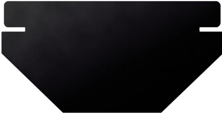
HTE45 17.09" x 33.13" overall 3/4" thick steel MINIMUM ORDER QUANTITY: 5